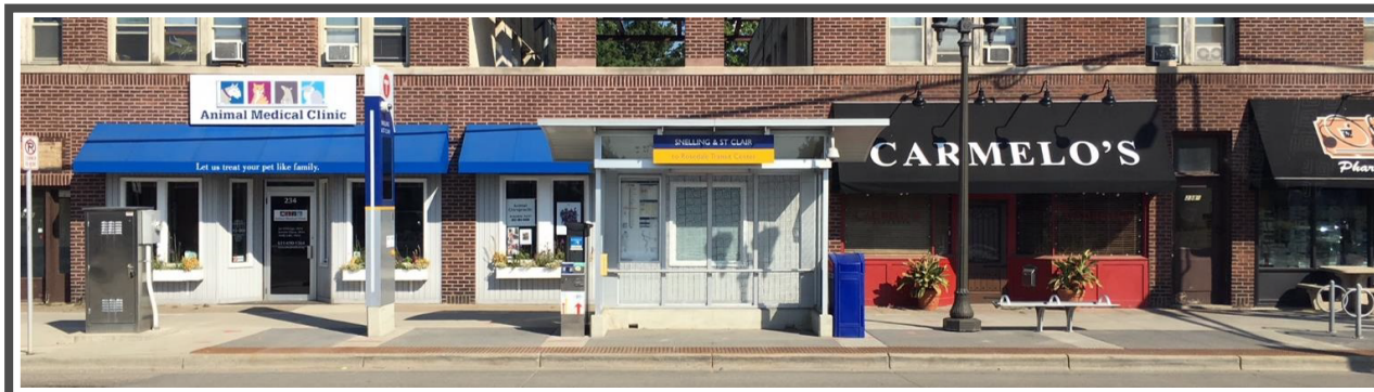
Northbound METRO A Line Station at Snelling Ave. and St. Clair Ave. B Line stations will look and feel similar to A Line stations.

Learn more about the B Line at www.metrotransit.org/b-line-project